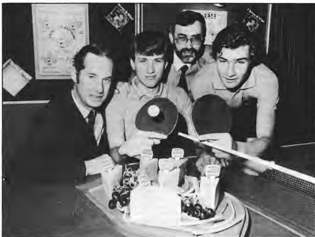
The Irish Open was held in Belfast during February, under the sponsorship of the "Wedgie" logo for cheese.

The tournament, first established in 1925, have applied to the ETTA for 3-Star status in 1987 or 1988.