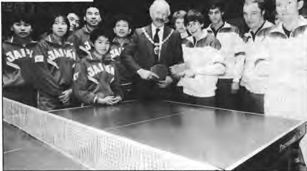
The two teams at Tonbridge

Rather like the World Cup is remembered for a particular goal, the Tonbridge event will be recorded in posterity for its blue table. Shock horror reverberated through the senior ranks but never in my short career in sports promotion have I seen such a transformation and impact on a sports arena the moment the blue table replaced the green.