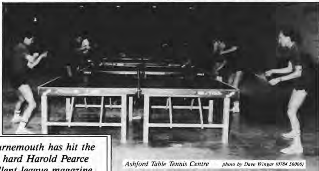
Ashford Table Tennis Centre

The league's first tournament was held in January and this also proved to be extremely successful. Local businesses put up £300 in cash prizes for the three events held.