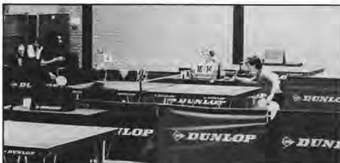
"You're in for a whupping, boy"

There was consolation for the No 4 singles seeds Fiona Elliot